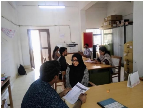
Mock interview organised by SELFEE