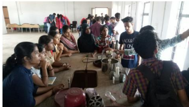
Electrical Maintenance Workshop organised by SELFEE