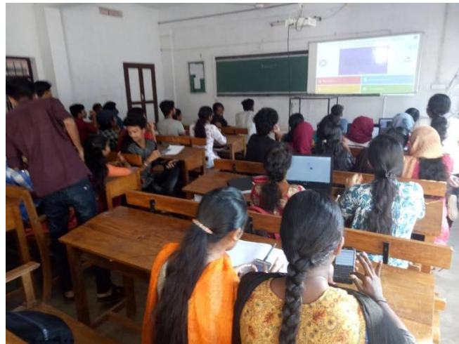
SELFEE - Quiz programmes arranged by students